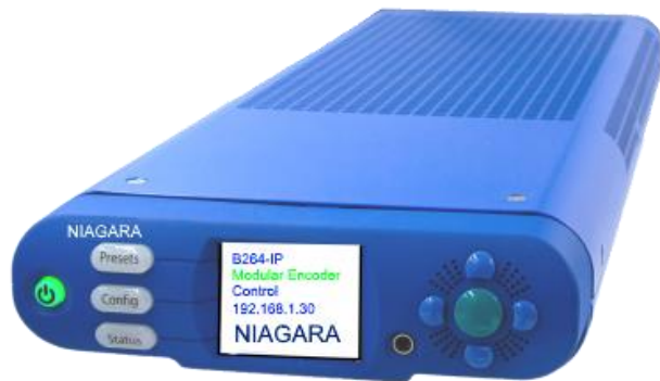
Stand Alone Model