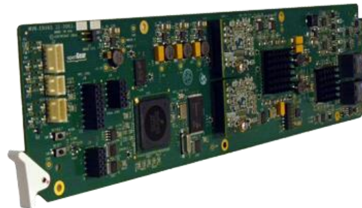
openGear card Model